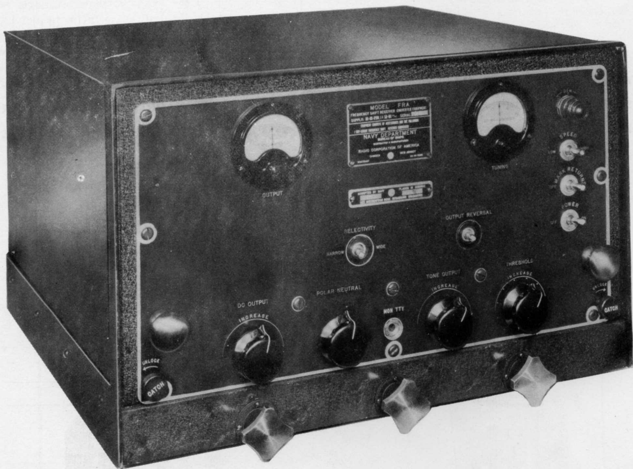
Frequency Shift Receiver Converting Equipment, Navy Model FRA