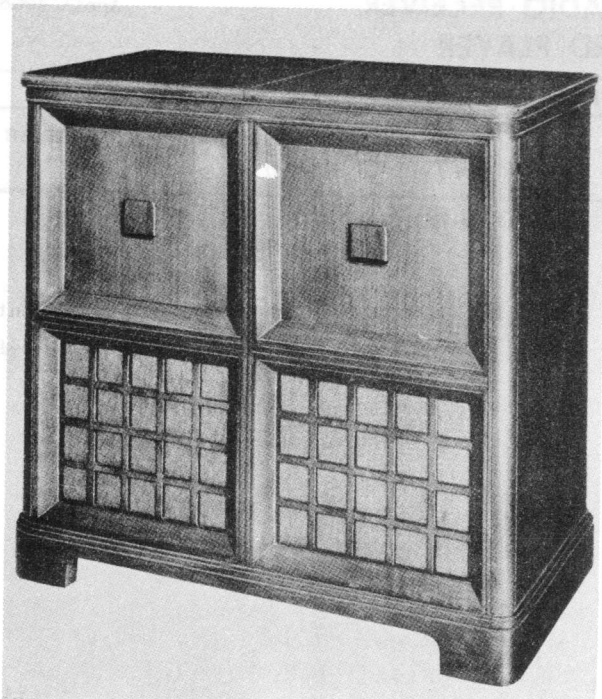
Radio Phonograph RCU-2

The RCU-2 is a combination radio receiver and record player installed in a console cabinet which also houses dual speakers. The record player is capable of accommodating 10 inch, 12 inch or 12 inch "V" disc records and turn off its power after the last record has been played. The radio receiver covers the Broadcast, Police and Short Wave bands.