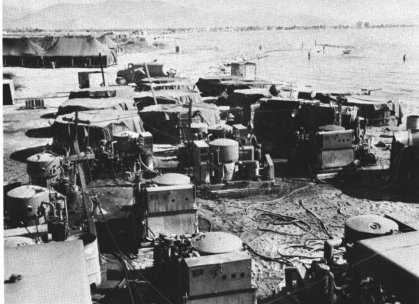
WATER WORKS —MCB Six distillation plant made fresh water from the sea.