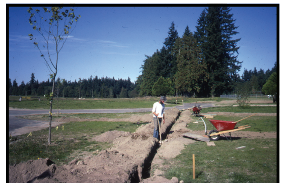
Park District installs irrigation system—1977