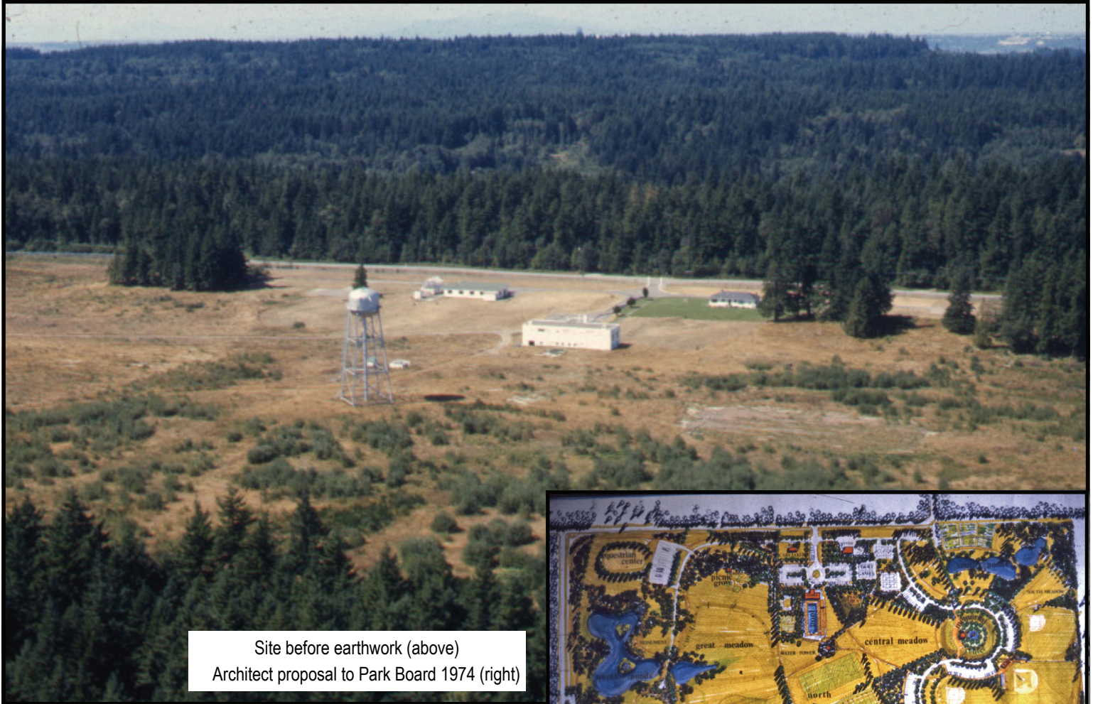
Site before earthwork (above) Architect proposal to Park Board 1974 (right)