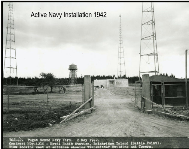
Active Navy Installation 1942