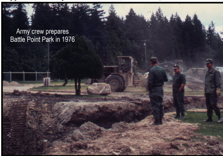
Army crew prepares Battle Point Park in 1976