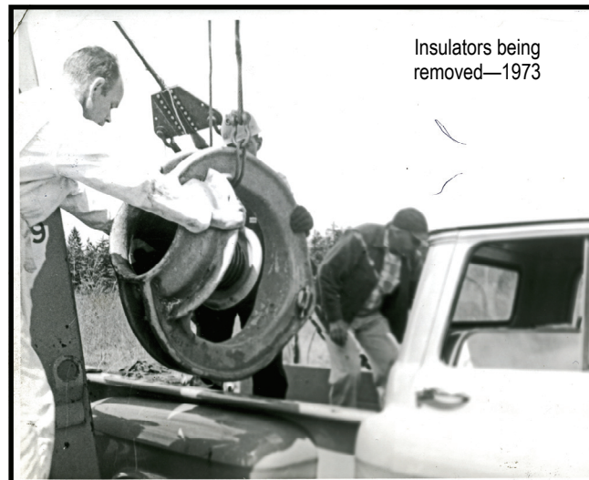
Insulators being removed—1973

Bids were solicited for the removal of the towers and a salvage firm in Seattle submitted a bid of $1 in exchange for having the salvage rights to the