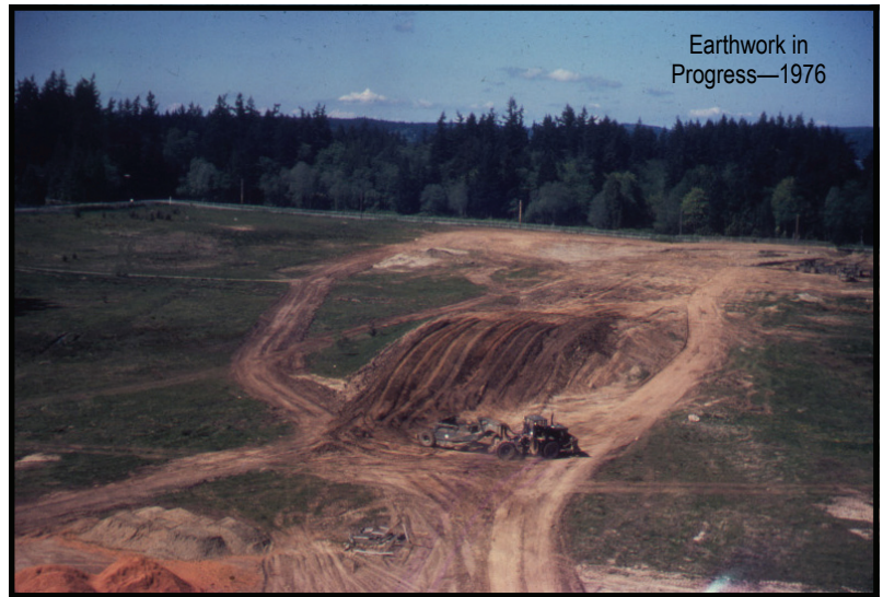
Earthwork in Progress—1976

call from a Regular Army engineering unit at Fort Lewis. After gaining support from affected local labor unions, the Army agreed to send two platoons to help build the park. The District agreed to use the transmitter building for housing and a mess hall. Additionally, the District paid for all fuel used to operate the bulldozers, graders, and other